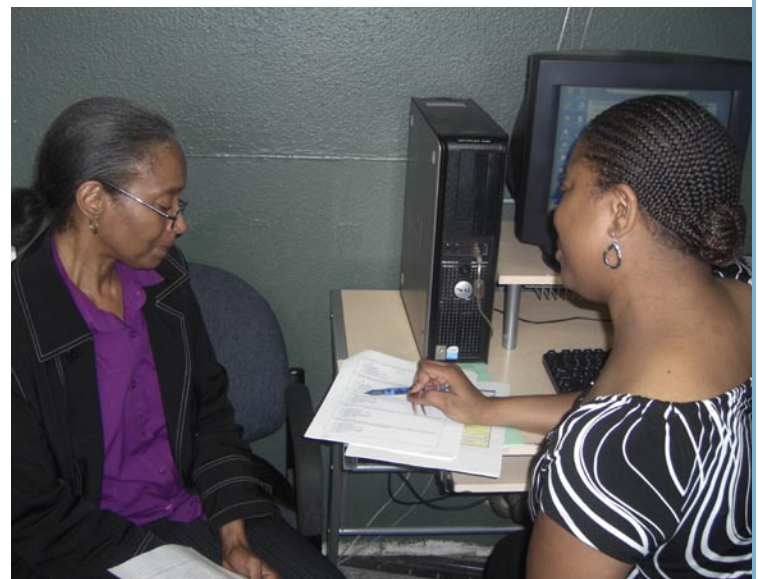
The NLEN Financial Coach works one-on-one with NLEN clients as needed.