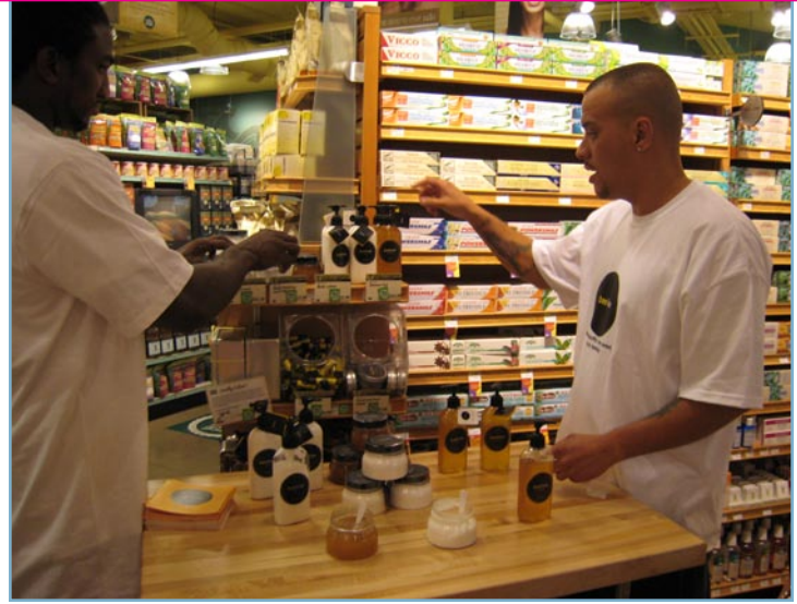
Sweet Beginnings workers set up for a product demonstration at a local Whole Foods Market.

Sweet Beginnings has hired 86 men and women since its 2004 inception. To date, 90 percent of workers have transitioned to unsubsidized employment, and participants have a recidivism rate of less than four percent. In the first 10 months of fiscal year 2008, Beeline product revenue and wage subsidies neared $200,000.