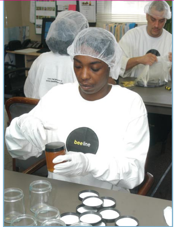
Sweet Beginnings workers package and label Beeline honey.

Along with directly assisting formerly incarcerated persons to successfully re-enter society, we also need to think about the policies that help or hinder these efforts. The public policies that permit such high rates of incarceration in the African American community and that create nearly insurmountable barriers to successful re-entry after a sentence is served need drastic reforms.