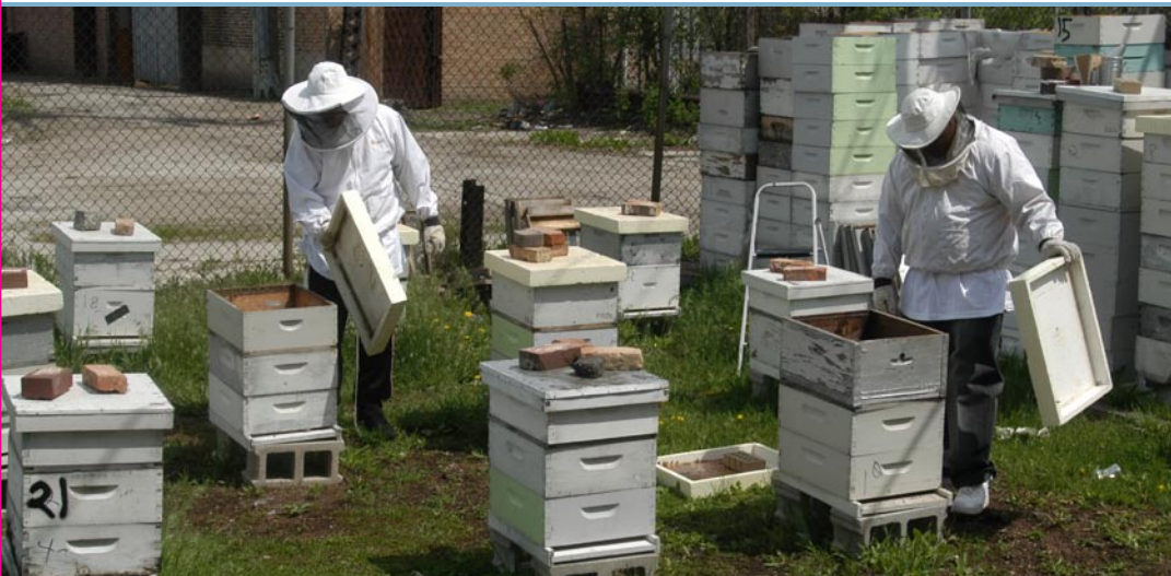
Sweet Beginnings has 35 beehives in NLEN's backyard.