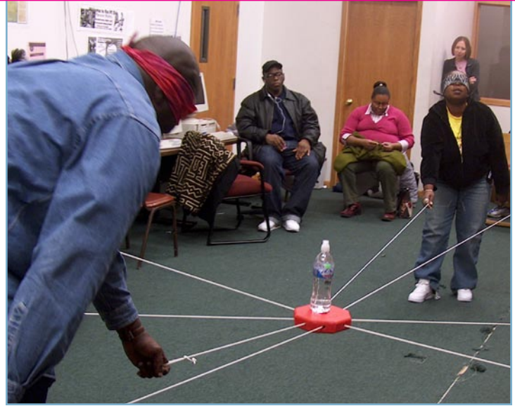
U-Turn Permitted participants gain experience in team work with the “toxic waste” exercise.

To help create the classroom environment, the four-week course begins with a consensus exercise, where the class develops its own contract, called Ground Rules, which governs participant-to-participant and participant-to-instructor