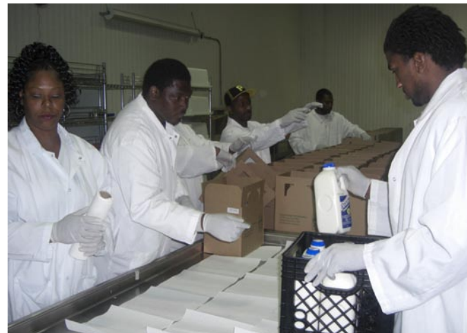
U-Turn Permitted participants gain valuable job experience at the Chicago Food Depository.

U-Turn Permitted seeks to: 1) facilitate a change in the participant's thinking and behavior that leads to an earnest job search, job acquisition, and increased retention, 2) provide the most useful job acquisition skills for formerly incarcerated persons, including helping with a résumé and cover letter, 3) create a sense of esprit de corps among each U-Turn class, and 4) provide hope and motivation for participants to engage, re-engage, and persevere in the job acquisition, maintenance, and career advancement processes. Participants need to succeed in the workforce beyond simply securing a job. They also need to retain and excel in employment, so that over time they can advance to family sustaining employment.