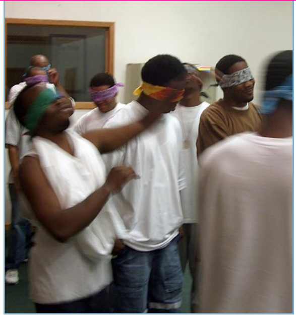
U-Turn Permitted participants engage in a classroom activity.