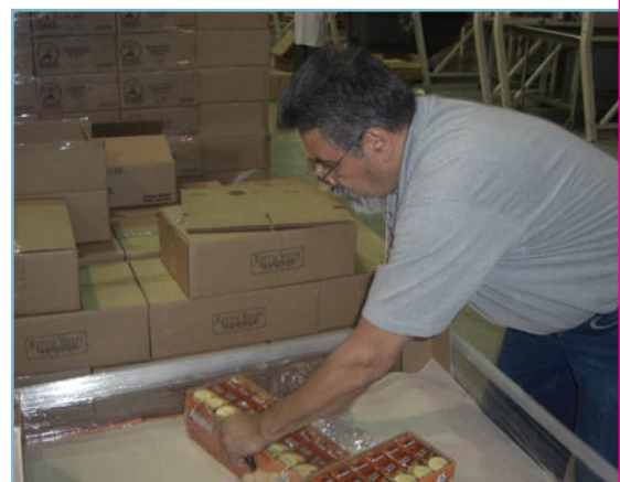
Left: An NLEN client works on a job application. Center: A Sweet Beginnings worker prepares to check on the health of a hive. Right: A U-Turn Permitted client gains work experience doing volunteer work.