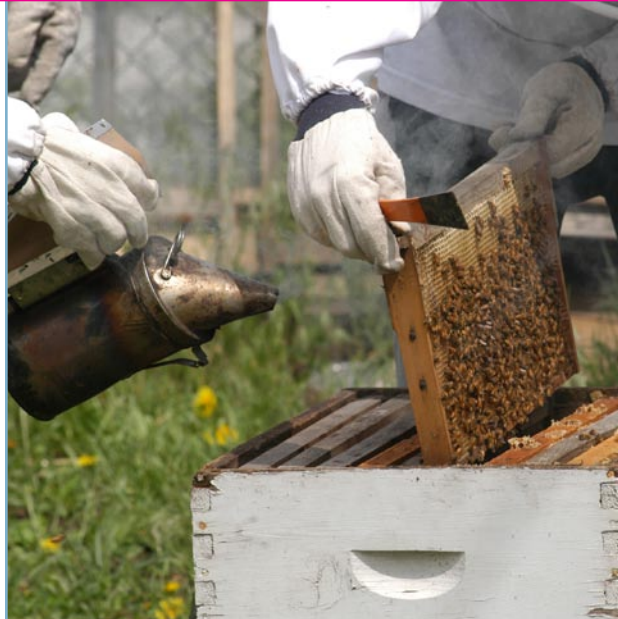
Sweet Beginnings workers calm the bees with smoke before checking on them.

Sweet Beginnings was incorporated in November 2006 in the State of Illinois. However, NLEN formed and piloted Sweet Beginnings in the summer of 2004 as a transitional jobs program for formerly incarcerated persons with seed funding from the Illinois Department of Corrections. The program started as a business that produced and sold urban honey primarily through local farmers markets.